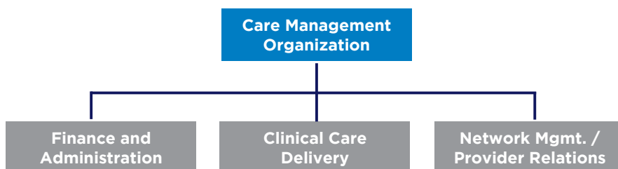
Figure B. Sample Centralized Care Management Organization Governance Structure

In developing an effective care management function, independent of the model chosen, accountability and authority runs through a clear reporting structure to a central care management organization. This requires thoughtful inclusion of network members on boards, committees and workgroups to develop and implement care models, evaluate network and provider performance and correct course of action. Typically, these bodies are organized into finance and administration, clinical care delivery, and network management and provider relations. While the design of an ideal governance structure can be challenging, implementing requires trust building, addressing unspoken and long neglected challenges, and establishing an often uncomfortable level of transparency to lay the groundwork for value creation and collaboration.